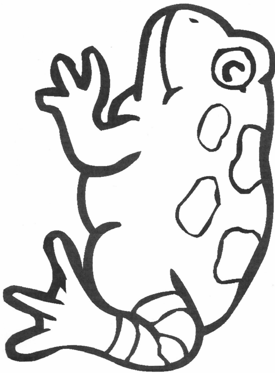
frog = chahkol ( chah-kole )